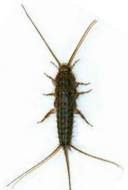
Four Lined Silverfish Ctenolepisma lineata