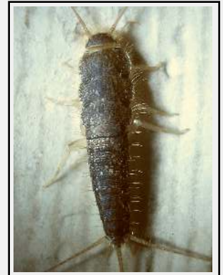
Grey Silverfish Ctenolepisma longicaudata