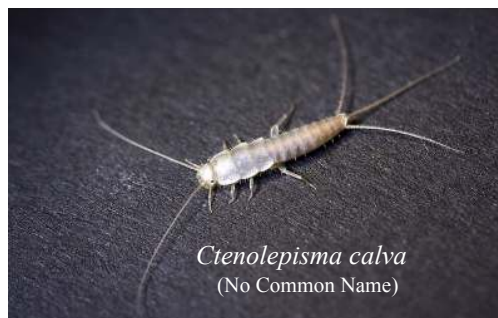
Ctenolepisma calva (No Common Name)

Regular cleaning around bookcases in cracks and crevices with a HEPA vacuum and sealing afterward can reduce potential breeding habitat. Application of desiccant dust in the cracks and along walls is another option.