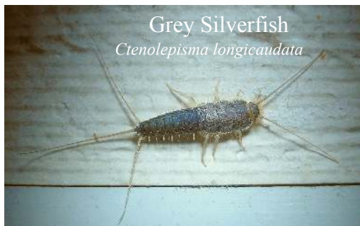
Grey Silverfish Ctenolepisma longicaudata

In Europe the small and white Ctenolepisma calva is also found and is spreading in museums and buildings